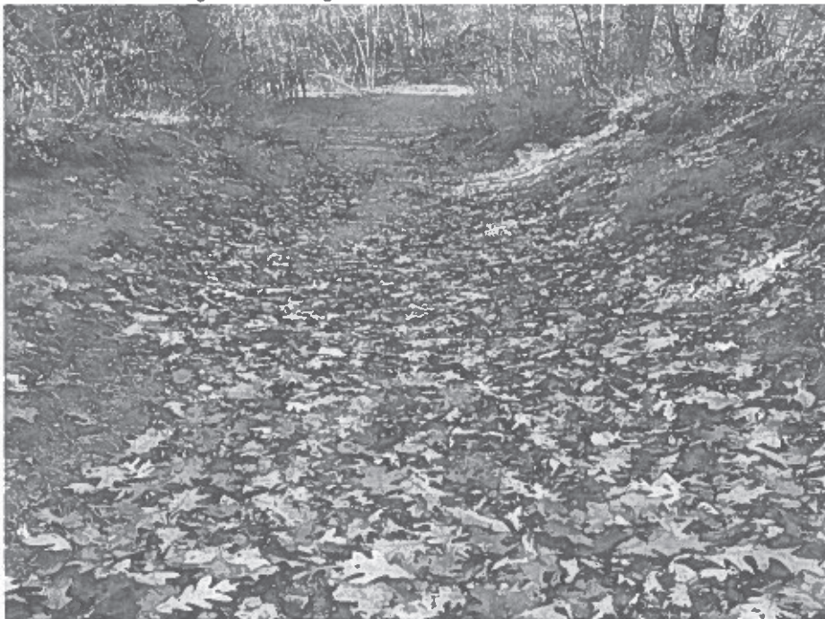
Figure 4: eroding trail section behind readiness center

Once you get behind the readiness center, the Red Trail is in good shape and leads back to the trailhead kiosk but a sign letting users know that the trail abuts the gate could be helpful as the trail used to cross where the building and parking lots currently stand.