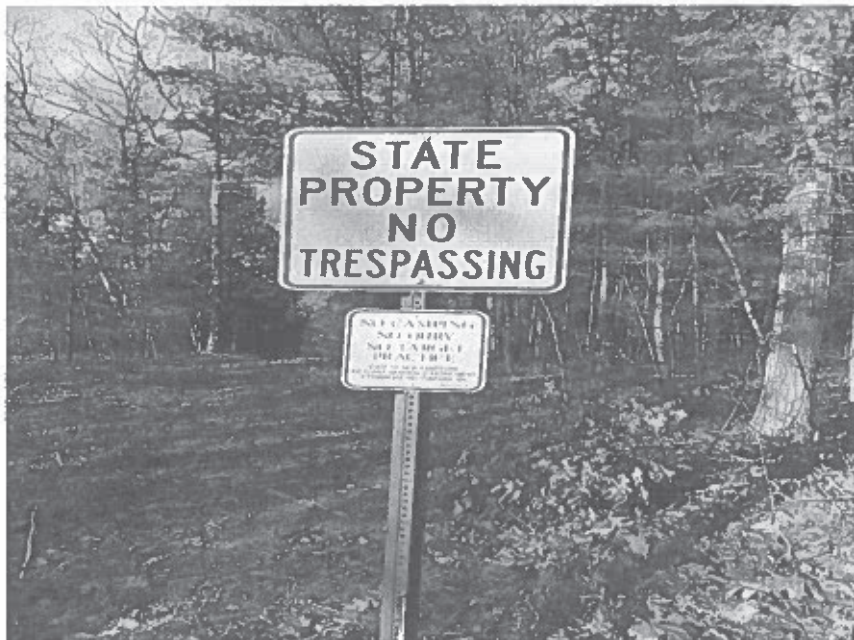
Figure 1: current trail signage

Lastly the blazing should be enhanced as there are some blazes throughout the trail system, but they are limited. Adding more would help enhance the user’s experience. Some color changes should also be considered. The change from a red blaze to an orange blaze is not very noticeable, but changing to a color like blue or white from a red or orange blaze would make it easier to tell when you change trails. A second trail coloring change should be made to accommodate users with color blindness by changing the Green Trail to either white or blue, allowing red, green color-blind users to be able to tell when they leave the Red Trail.