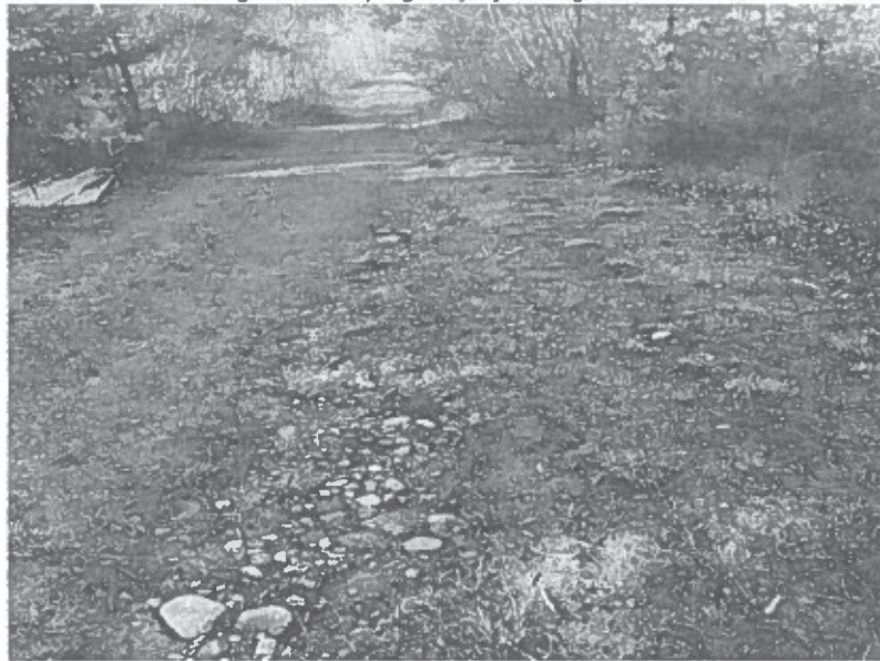
Figure 2: early signs of a forming washout

The next area of improvement along the Red Trail comes shortly after the Green Trail intersection if one were to head south toward the Orange Trail. There is a seasonal stream that flows across the trail toward the Soucook River. A culvert, or small bridge, should be installed over this wet area along with ditching out the stream channel to help it flow better. The culvert would be the most cost-effective and easiest to maintain option (See figure 3).