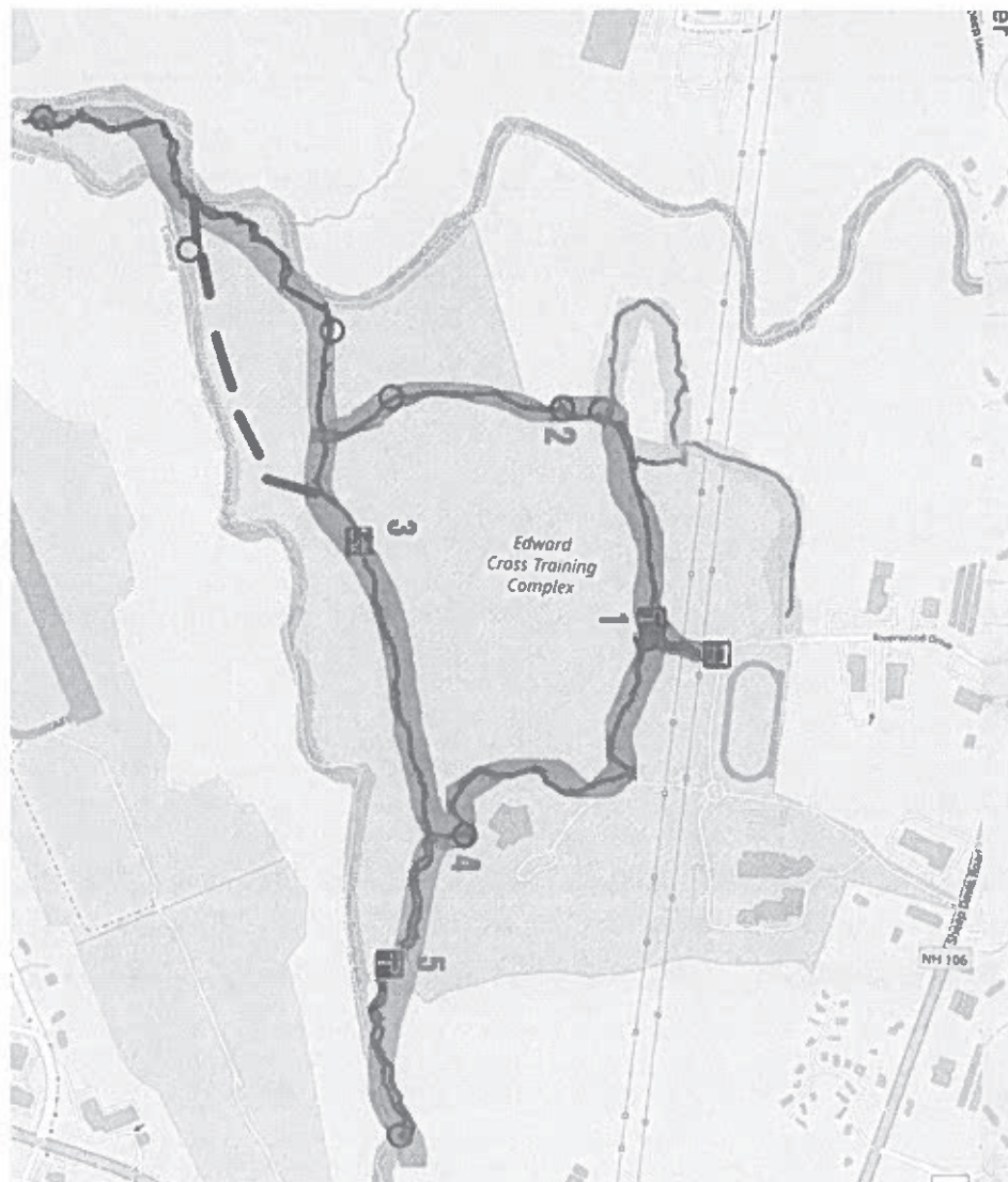
Map #3: Trail map with trail colors highlighted and figures marked