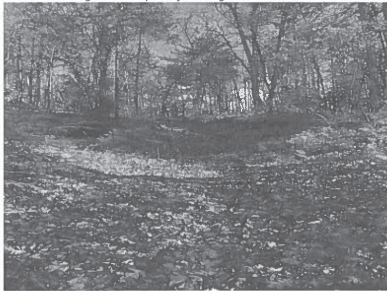
Figure 5: steep 500 foot long washout

The trail does continue past the property line but if the abutting property is not acquired or a trail agreement with the abutter is not reached, a sign letting users know that the trail will no longer be maintained going forward should be created and installed. The trail should also consider a name/color change as the orange paint used for the blazes is very similar to the red blazes making it seem like you are on the red trail from afar. Switching to a color such as blue will make it easier for users to know what trail they are on.