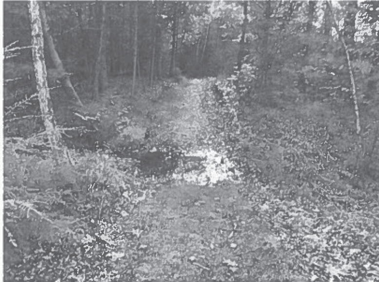
Figure 3: install culvert or bridge

The last trail issue along the Red Trail is similar to the first. The hill next to the readiness center that the Red Trail goes over is washing out. Drainage features such as water bars and a drainage ditch down one side would help to slow the erosion, while installing 3 to 5 check steps would help to break up the steep grade (see figure 4).